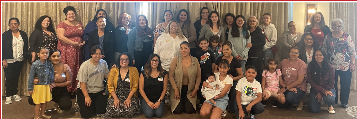
Monterey Park Community Dinner 08.12.22