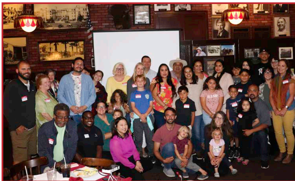
Santa Barbara Community Dinner 05.11.22