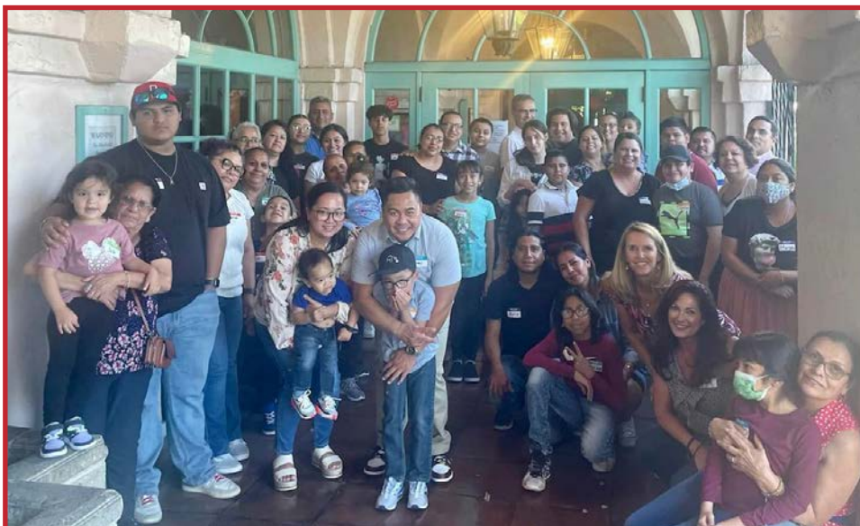
Los Angeles Community Dinner 06.14.22