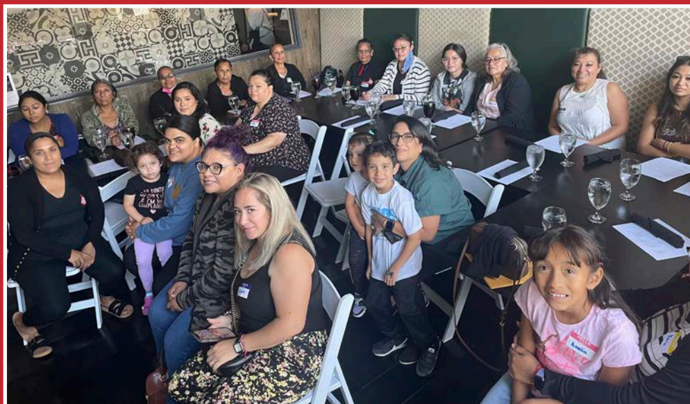
Whittier Community Dinner 05.25.22