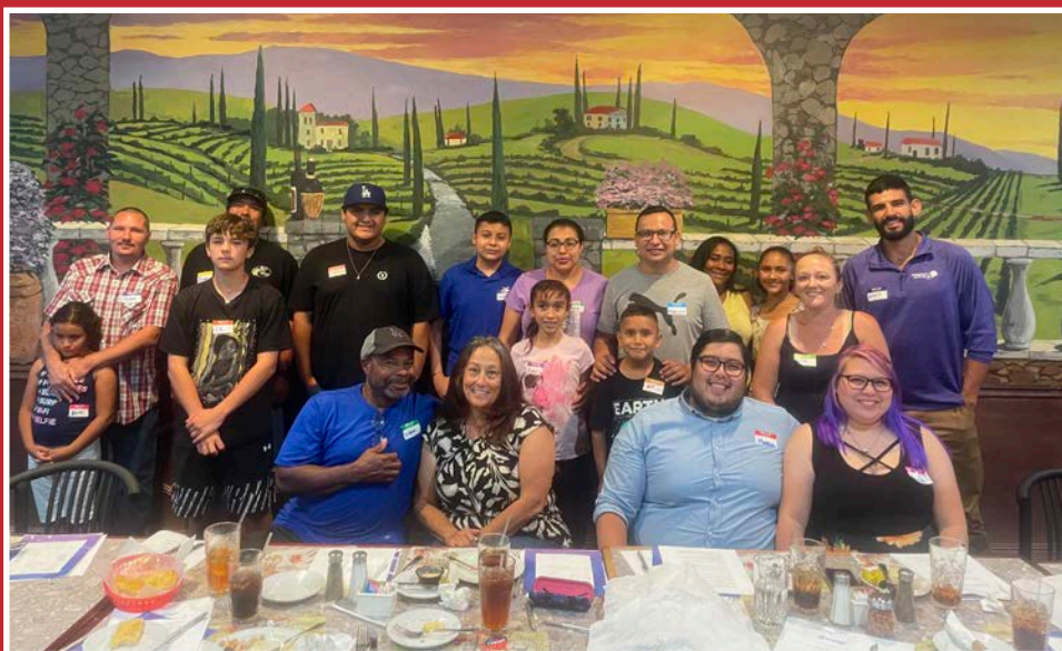
Lancaster Community Dinner 06.07.22